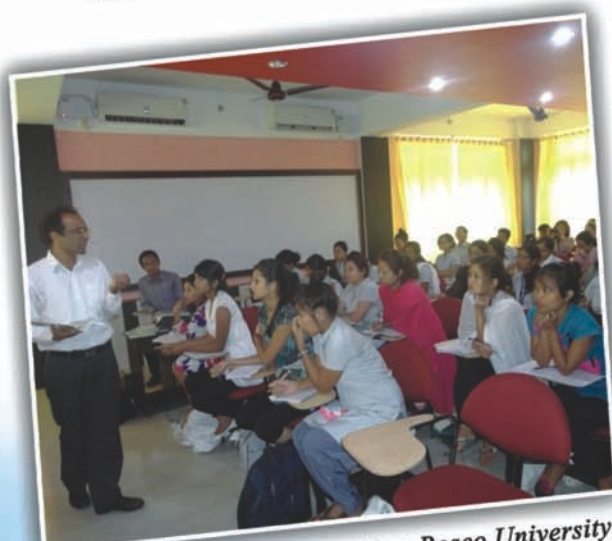
MSW students from Assam Don Bosco University on observation visit to LCHR