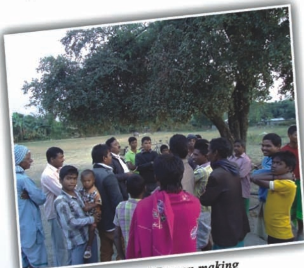
Para Legal Person making rural people aware of their rights