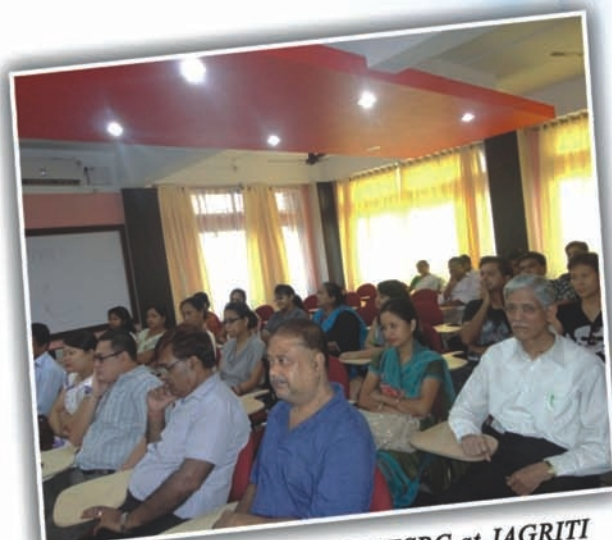
Well wishers of LCHR & NESRC at JAGRITI