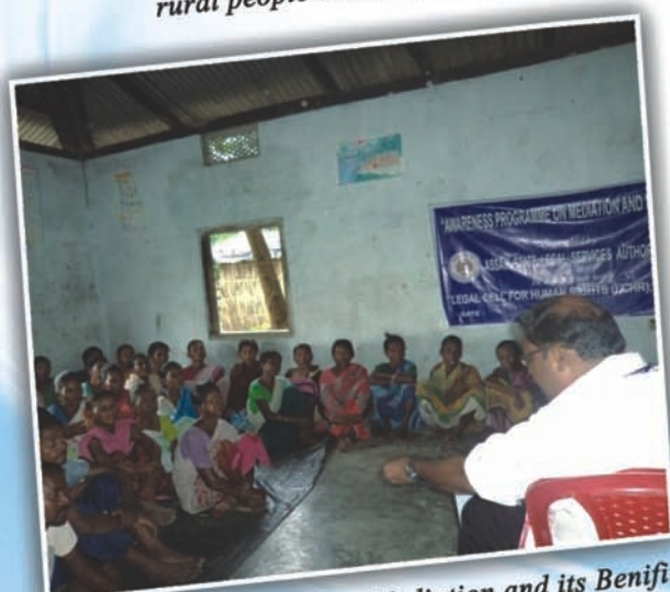
Participants at a camp on Mediation and its Benefits organized by ASLSA in collaboration with LCHR