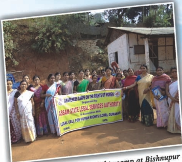
Participants of women rights camp at Bishnupur