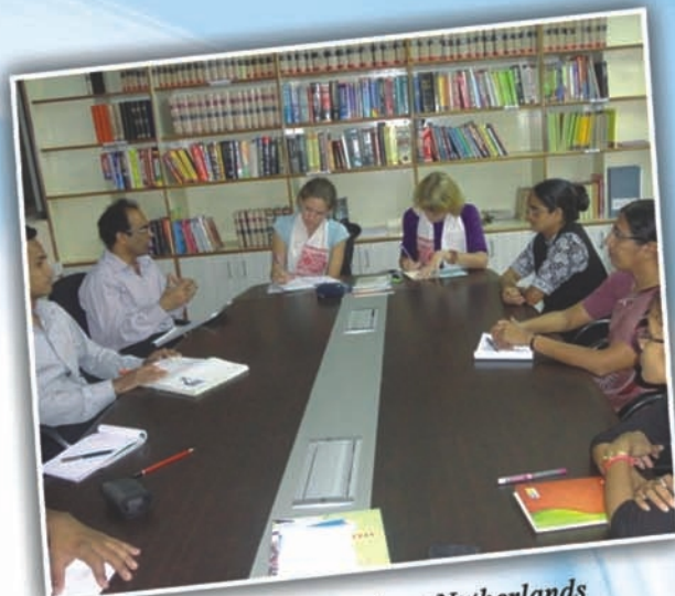
Our Partners from Netherlands