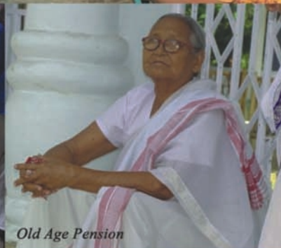
Old Age Pension