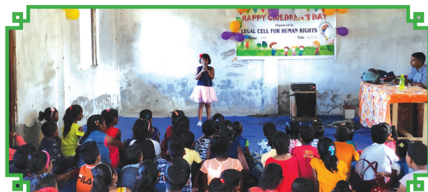
Poem recitation during Children's day at Morachengelijan, Gohpur