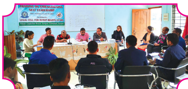
Fifth Executive Meeting of NELF at Capuchin House, Guwahati