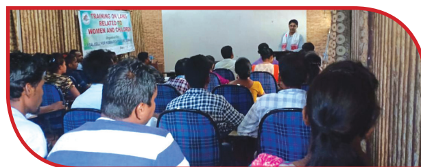
Training on Laws & Schemes related to Women & Children at NEDSF, Guwahati