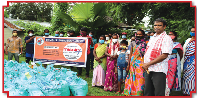
Zaloni T.E. (Dibrugarh)