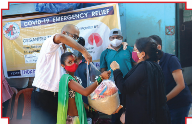
Indrapur Kamrup (M)