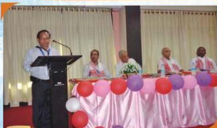
2nd Regional Workshop at Seminar Hall (LCHR)