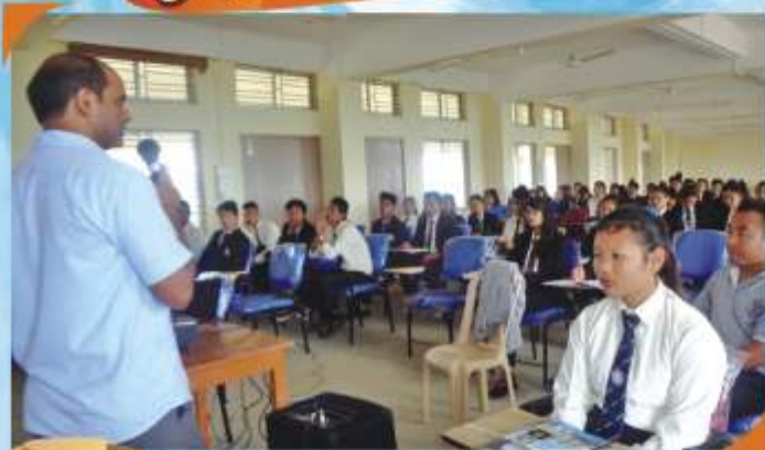
Legal Orientation at St. Xavier's College, Tezpur