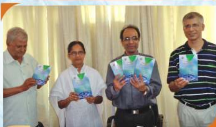
LCHR released success stories at Conference Room (LCHR)