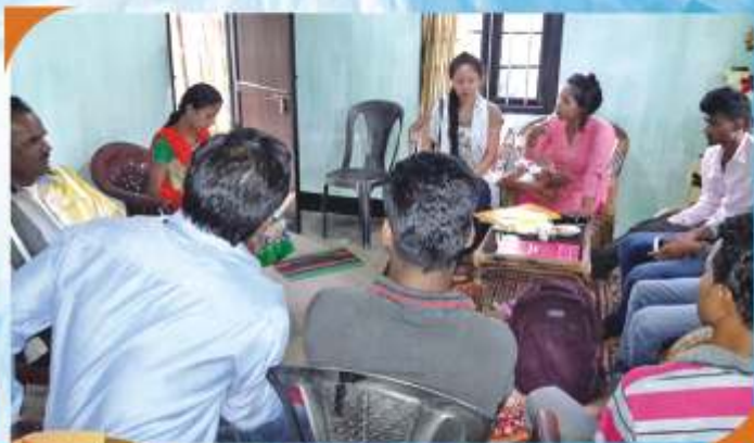
Monitoring at Dejoo Tea Estate, Lakhimpur