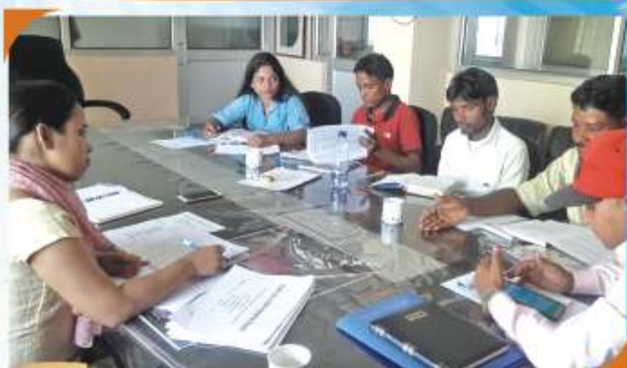
Dist Coordinator meet at LCHR Reference Room (LCHR)