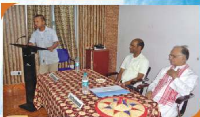
3rd regional Workshop- NELF at Kharguli, Guwahati