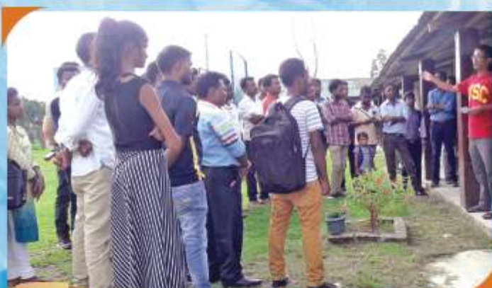
PLP Exposure visit at Jagun, Tinsukia